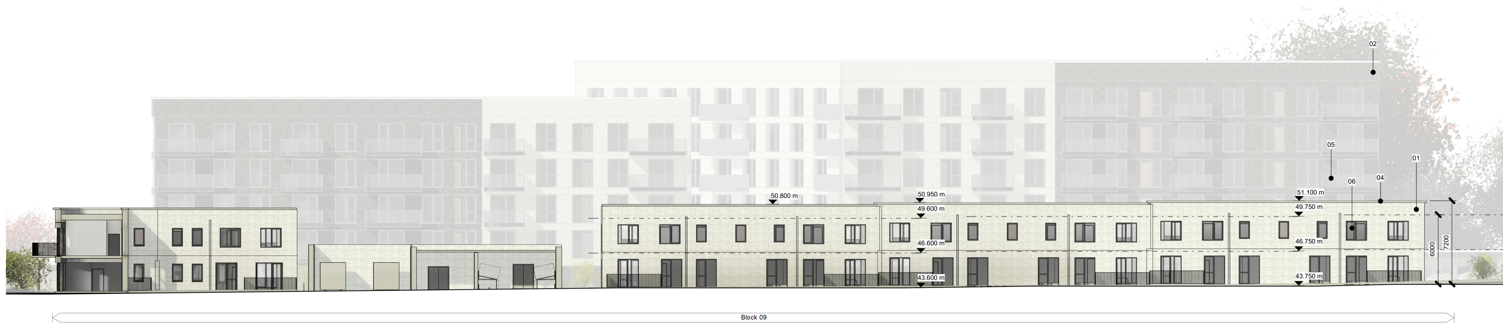
Block 09, Part 02, South (Rear) Elevation 1 : 200

Notes: - Do not scale from this drawing. Use figured dimensions in all cases. - Verify dimensions on site and report any discrepancies to the Architect immediately. - This drawing is to be read in conjunction with the Architect's Specification. - © This drawing is copyright and may only be reproduced with the Architect's permission.