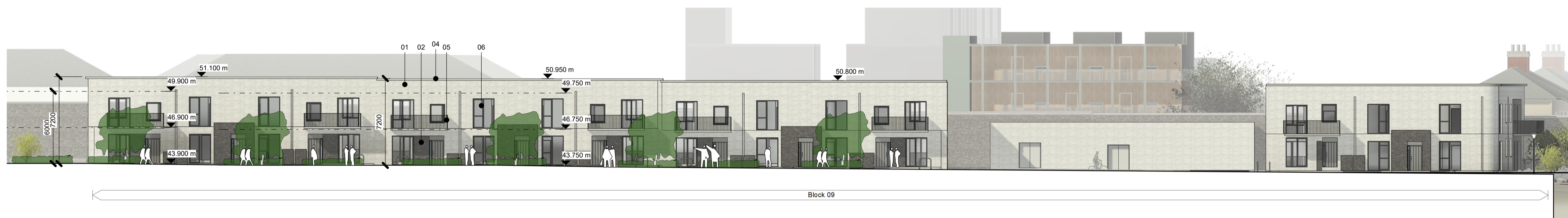
Block 09, Part 02, North (Front) Elevation 1 : 200